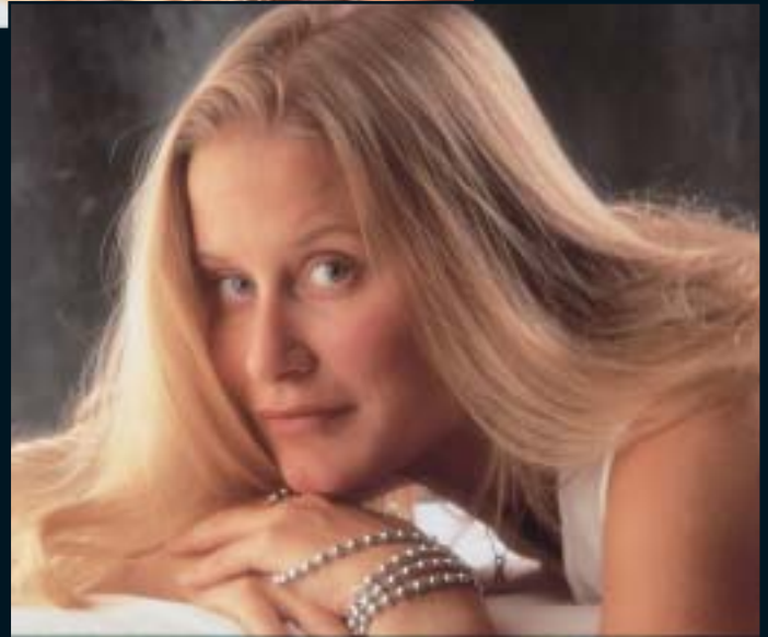
Black Diffusion/FX 5 filter