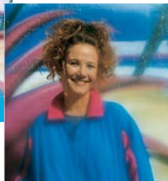
Warm Center Spot