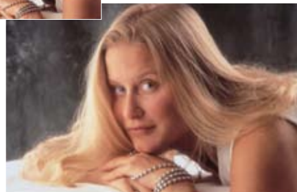
Black Diffusion/FX® 3